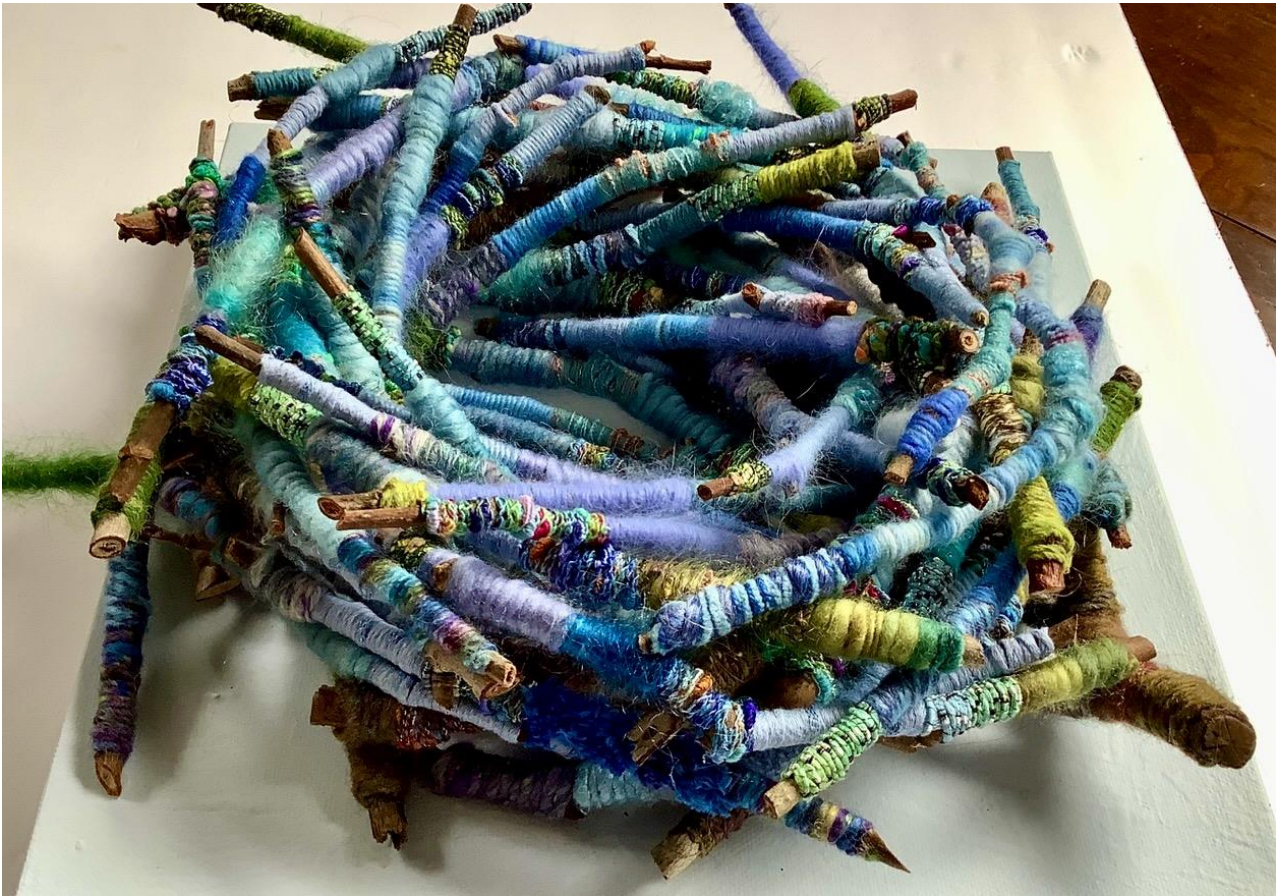
Sky Nest by Carolyn Chambers, twigs and yarn, 12 x 12 x 5", in Craftmakers' Outside the Box at Art Central, opening October 6