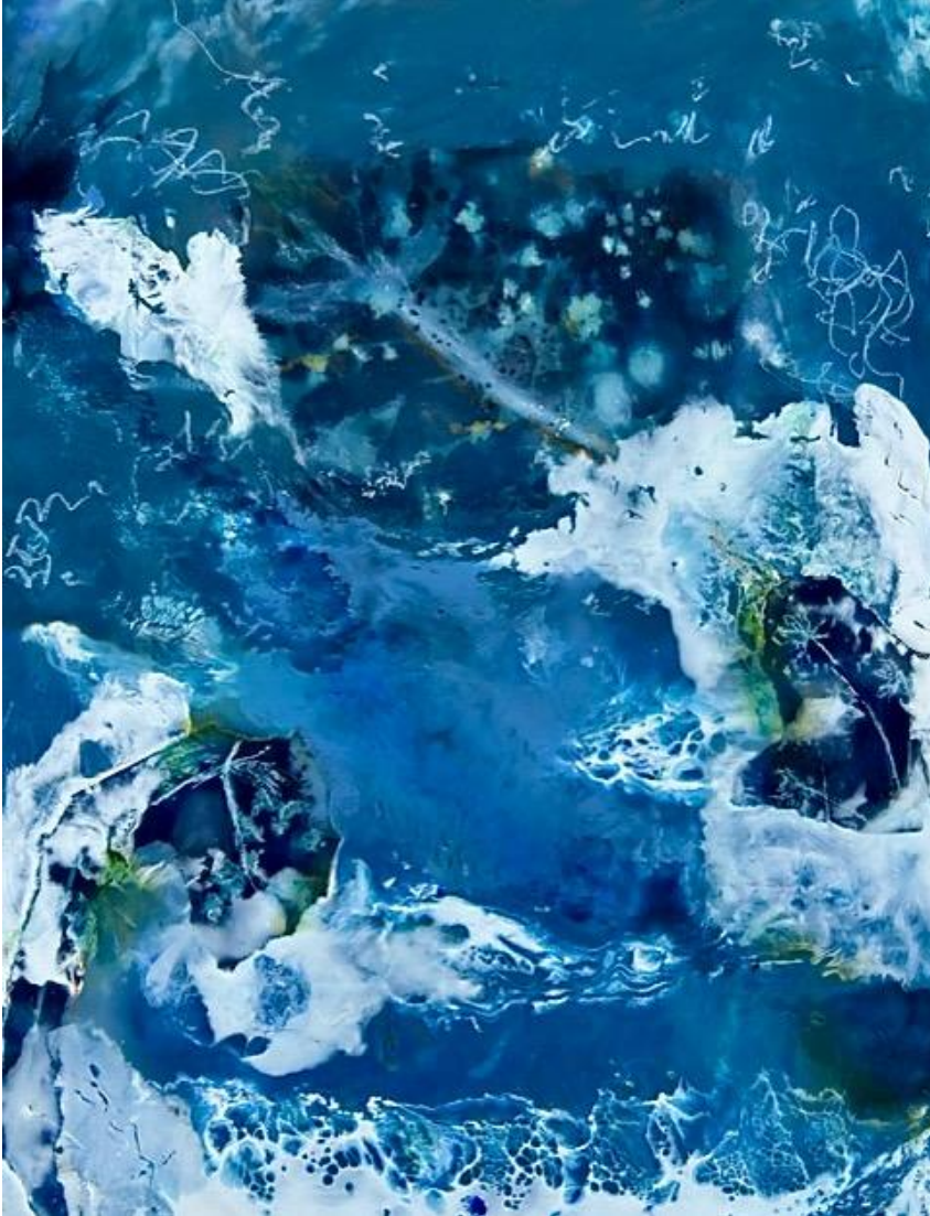
Linda Elder's encaustic is on view in the exhibition Inspiration at Art Center Morro Bay, through November 6.