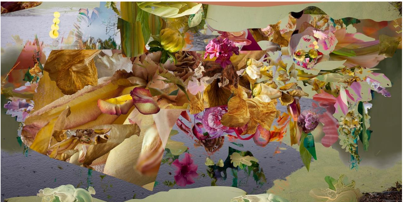
The Long Float, 2022 by Carol Paquet, digital collage, pigment ink print, 30x60, Ed. 5