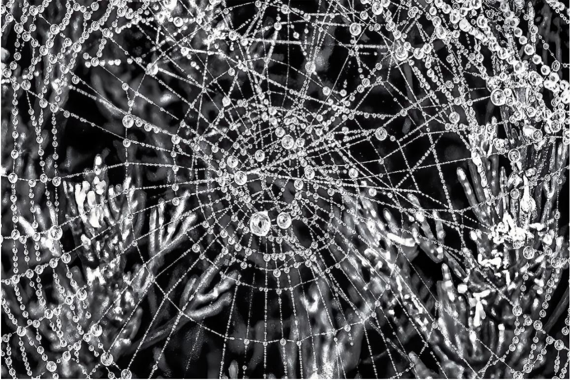
Jeweled Engagement, Valencia Peak Trail