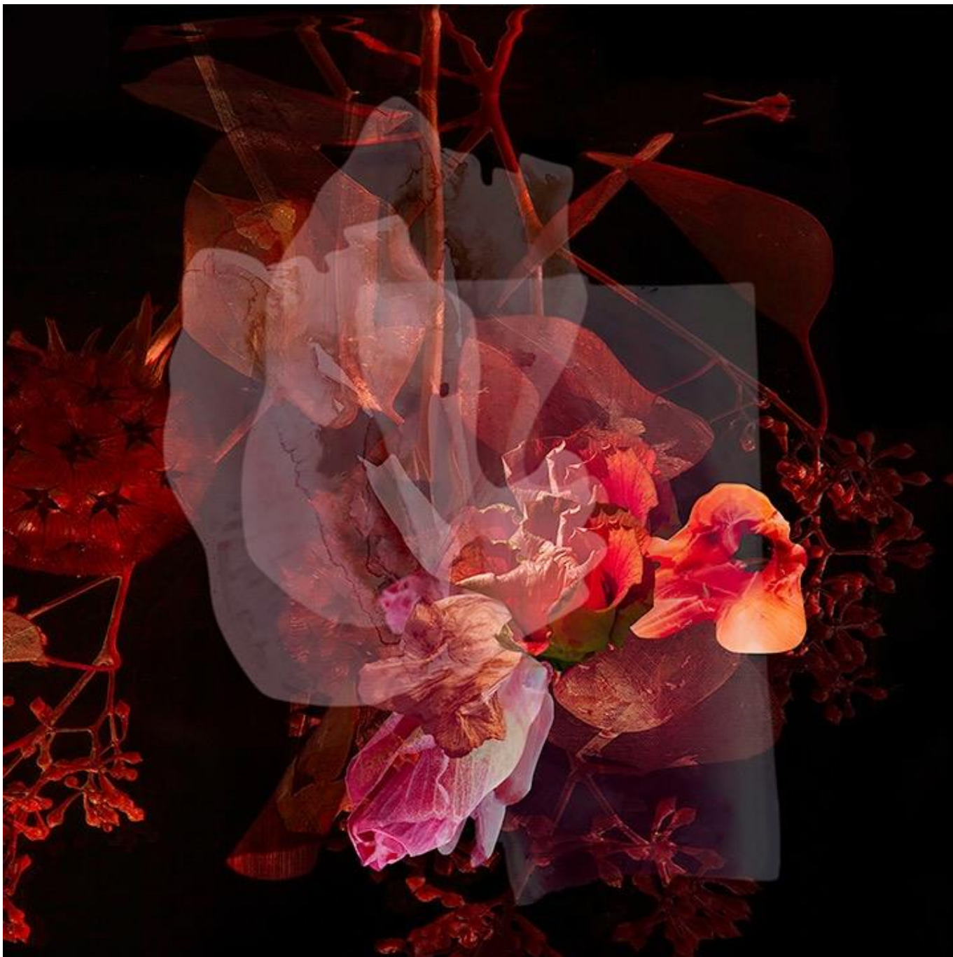
Cherry Bomb 2, 2021, digital collage, pigment ink print, 40 x 40, Ed. 3