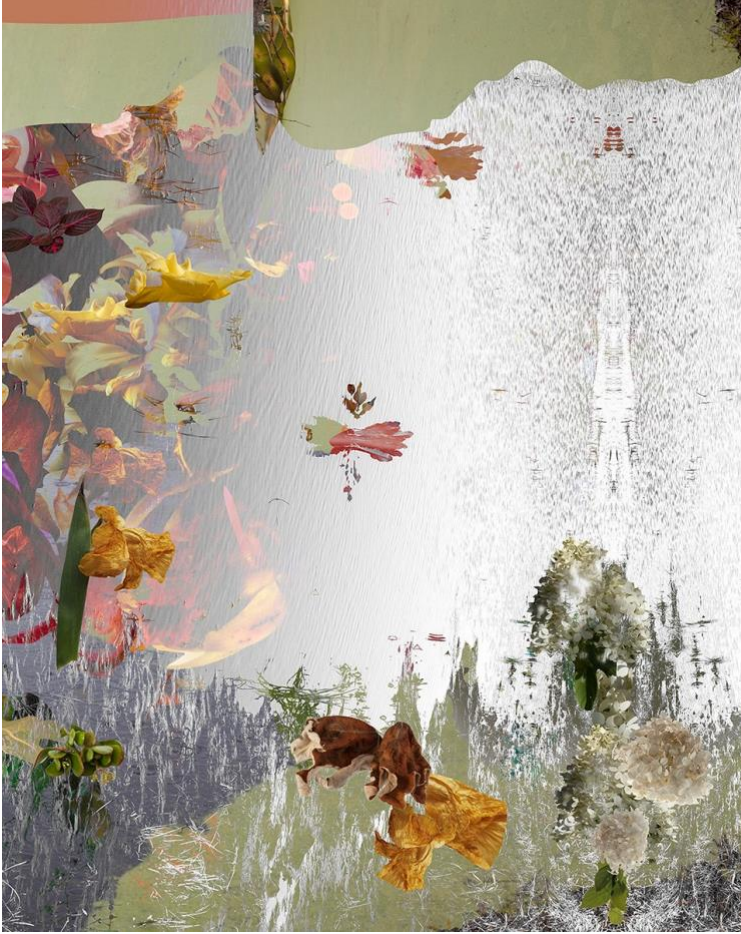
Silver Fallout, 2022 by Carol Paquet, digital collage, pigment ink print, 30 x 24, Ed. 5