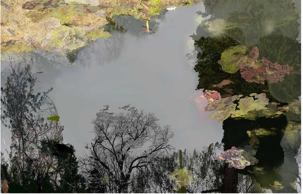
Reflections, 2023 by Carol Paquet, digital collage, pigment ink print, 30x50, Ed. 3