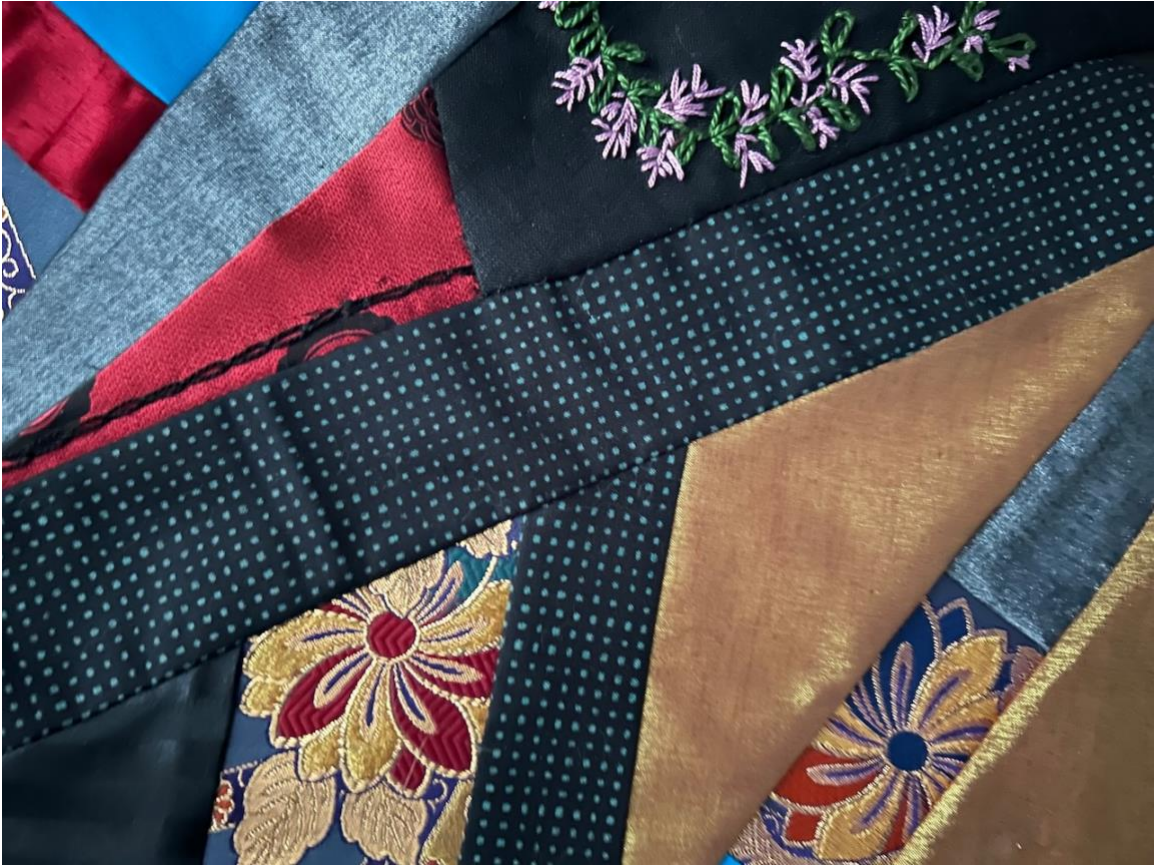
Detail of Stitched Fabric by Gini Griffin, in Craftmakers' Outside the Box